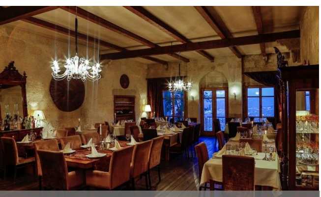
Dinner at 'Elai' restaurant