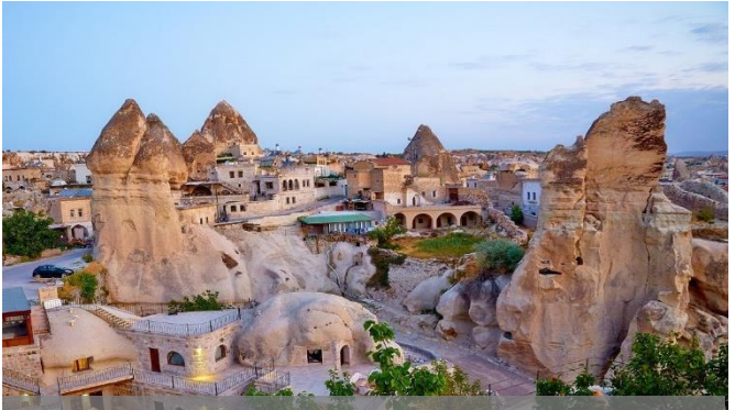
Visit open-air museum Goreme