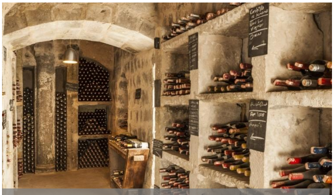
Wine Tasting at a historical cave

Lunch at the authentic Millocal Restaurant