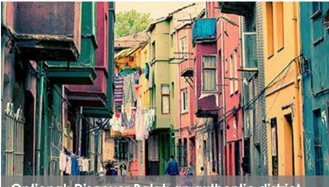
Optional: Discover Balat; an authentic district

<u>Optional:</u> Visit the Ottoman Topkapi Palace