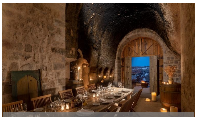
Dinner at a Chapel