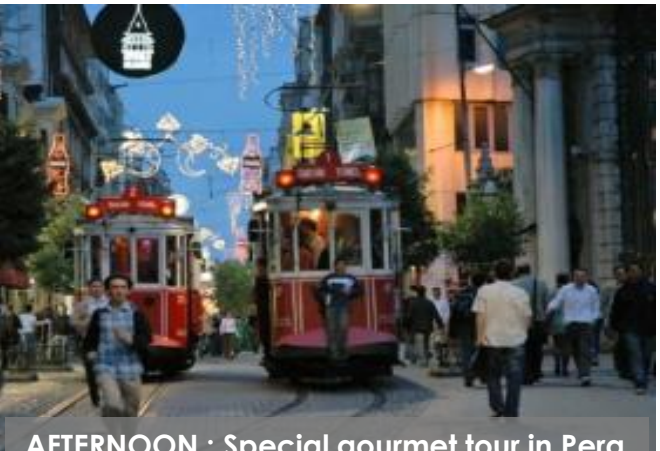
<u>AFTERNOON : Special gourmet tour in Pera</u>