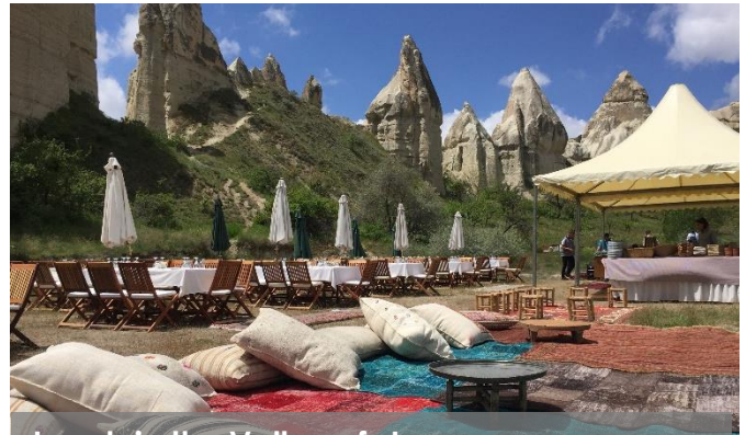
Lunch in the Valley of «Love»