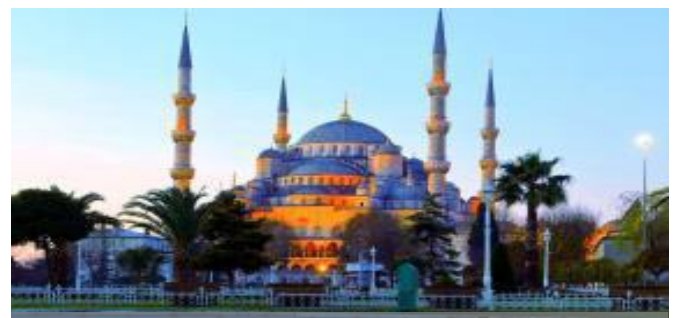
In the heart of the old city (Hippodrome, Blue Mosuqe, Hagia Sophia and the Underground Cistern)