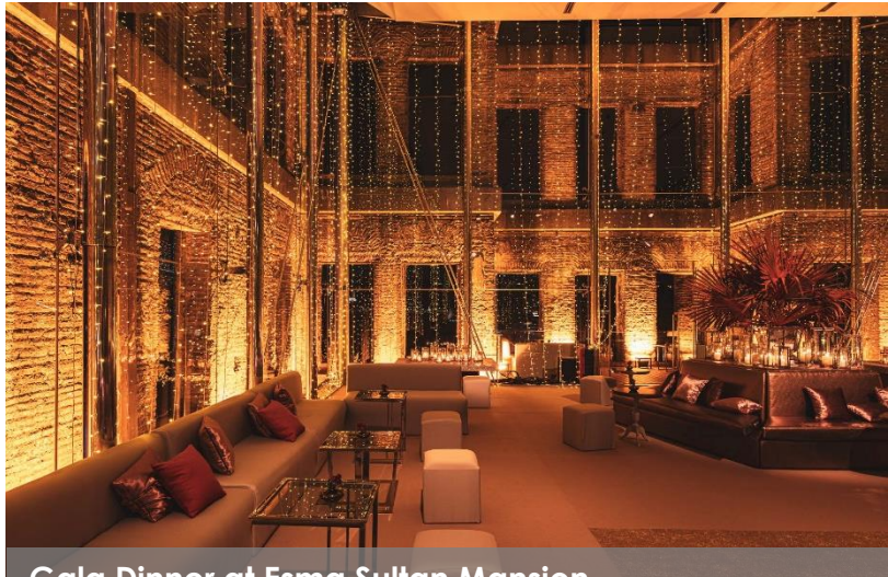
Gala Dinner at Esma Sultan Mansion