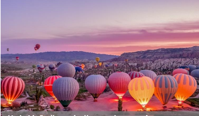
Hot-Air Balloon in the early morning