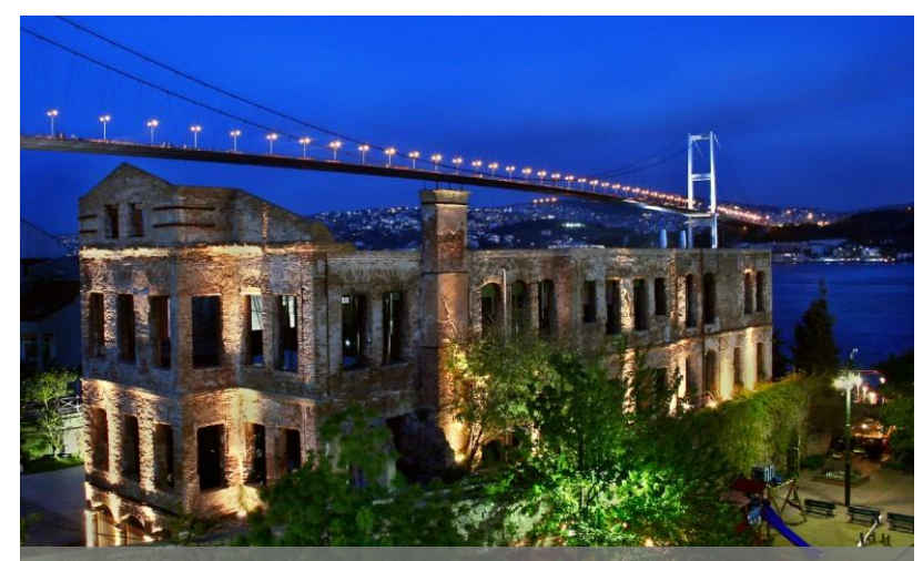
Optional Gala Dinner at Esma Sultan Mansion

"Nomads" Restaurant with shows, authentic dances, percussion performance and DJ