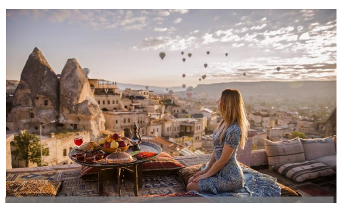
Lunch at Dibek Restaurant