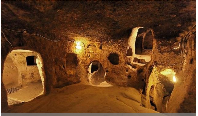
Visit Underground City : Kaymakli